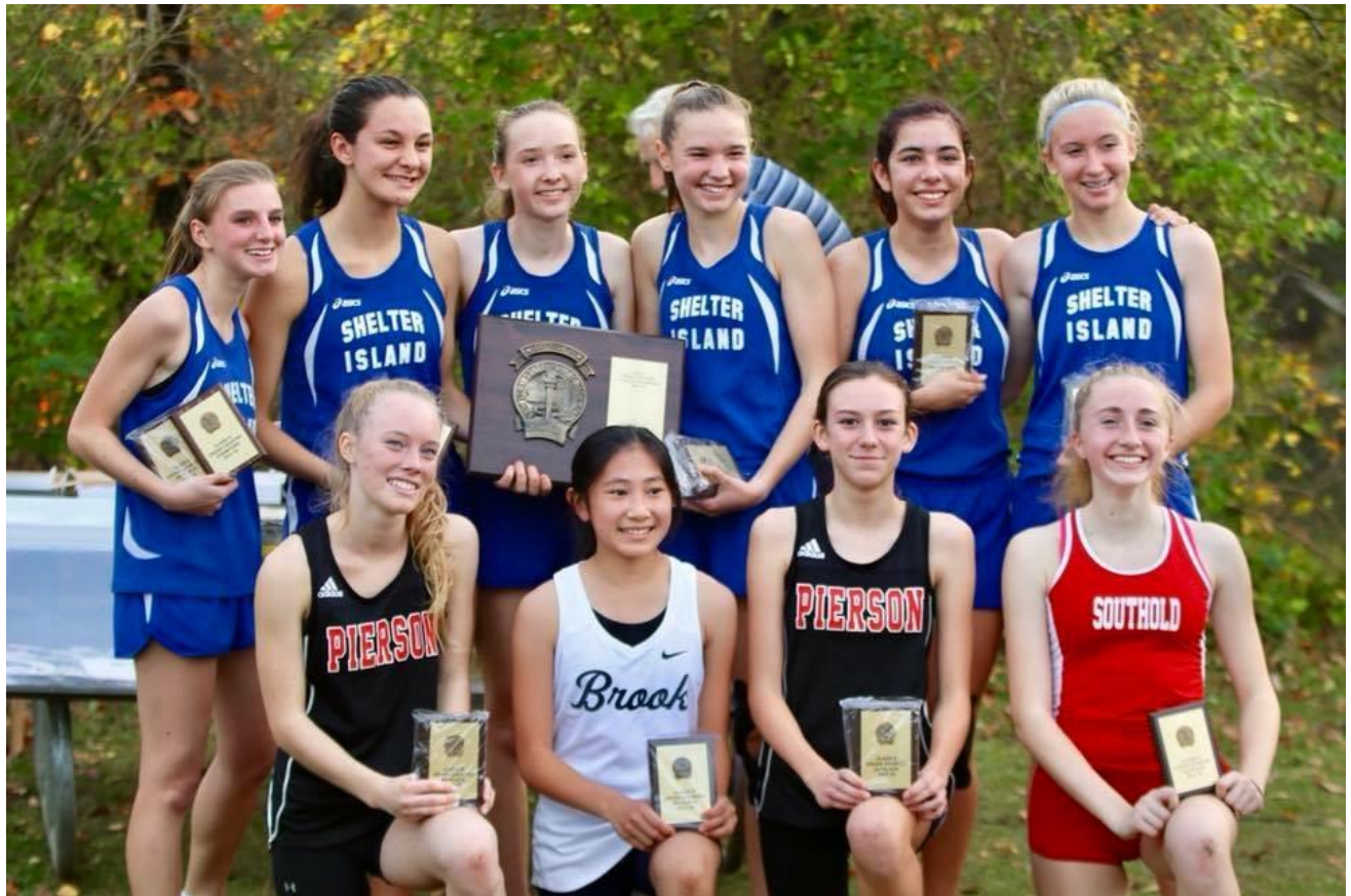
Class D 2017 NYS XC Squad at Counties award ceremony