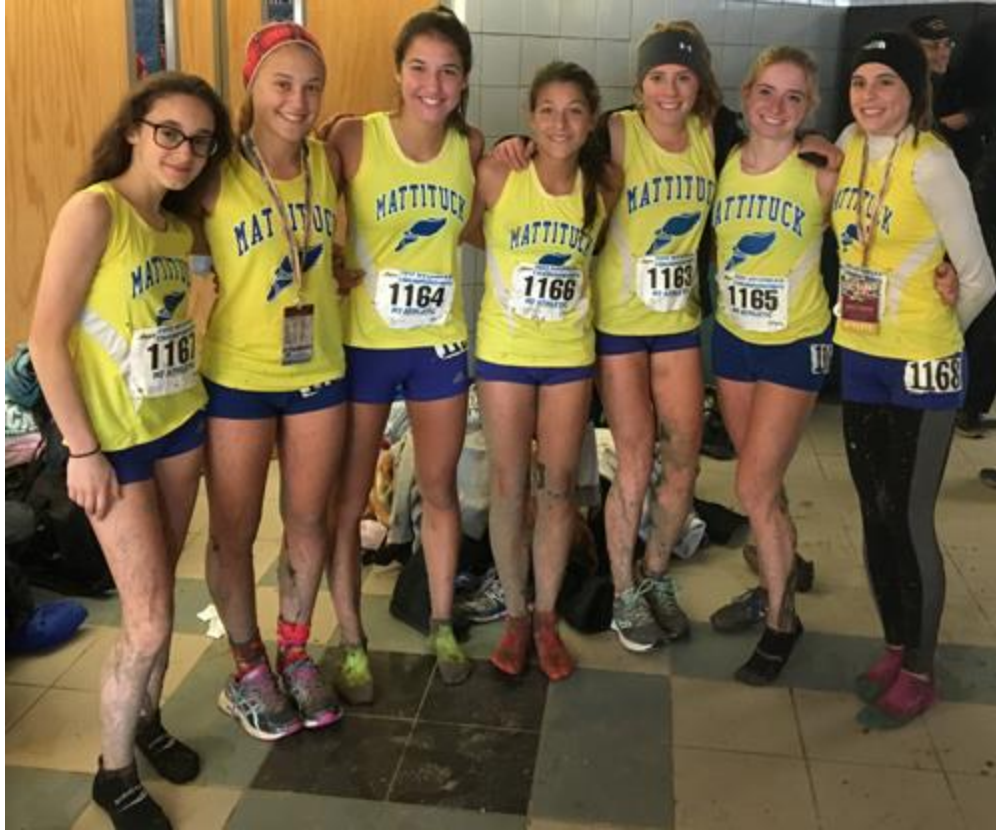
Mattituck after its race in the mud and cold at 2017 States