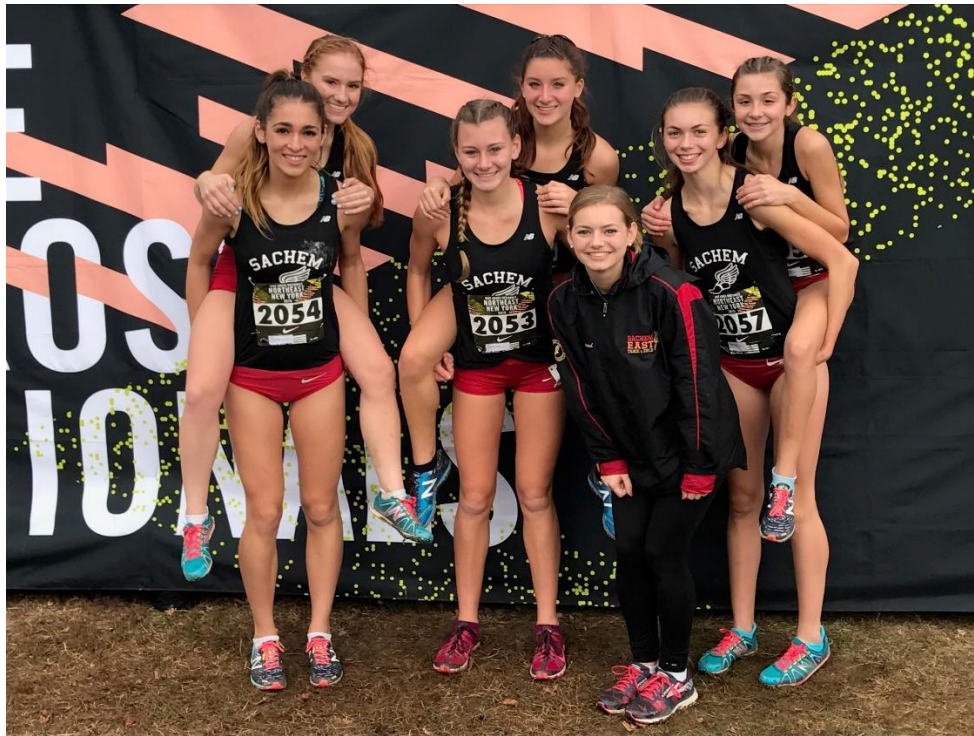
2017 Sachem XC squad at Nike XC Regionals

Top runners in Class A know each other very well. The top eleven finishers from the 2017 Counties race are all returning.